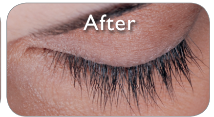
Unretouched photos of Latisse™ users in the clinical trial before starting treatment and at week 16. The onset of effect with Latisse™ solution is gradual. In the clinical trial, the majority of users saw significant improvement by 2 months. 1 Individual results may vary.

Eyelash hypotrichosis is another name for having inadequate or not enough eyelashes.